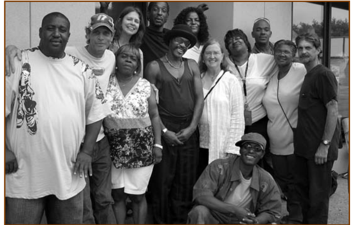
Volunteers and Members have formed a team ministry at Repairers of the Breach.