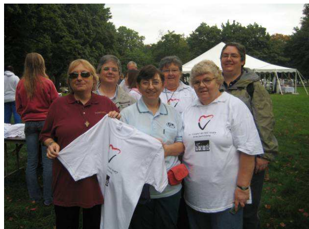
St. Vincent de Paul Walk for the Poor