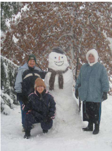
Our first big Snow!