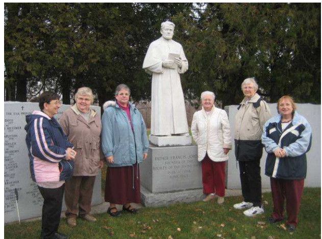
Our Salvatorian Heritage Tour of St. Nazianz