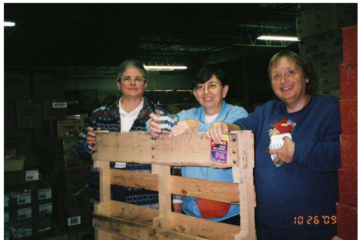
Ministry at the Mission Warehouse

Once a month, we work at our Salvatorian Mission Warehouse in New Holstein. It is very rewarding to be able to help in this ministry and the people who work at the Warehouse are the best!