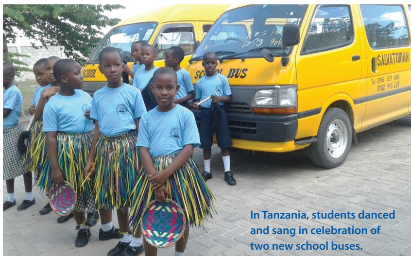
In Tanzania, students danced and sang in celebration of two new school buses.

We may be another year older, but that doesn't mean the Sisters of the Divine Savior are slowing down. In fact, your generosity in 2022 enabled us to fund more projects than ever! Together, we bused children to school in Buyuni, Tanzania, sheltered Ukrainian refugees, professionally educated four Sri Lankan Salvatorian Sisters, farmed organically in southern Tanzania, and cared for our elder sisters at Salvatorian Sisters Residence (SSR). Your faithful support encouraged us to find new ways to bring goodness and kindness to God's people in whatever place and by whatever means in 2022.