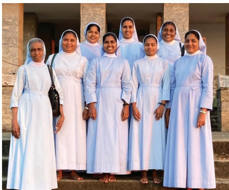
Your Giving Tuesday gifts support the educational ambitions of our junior, or temporary vowed, sisters in Sri Lanka.